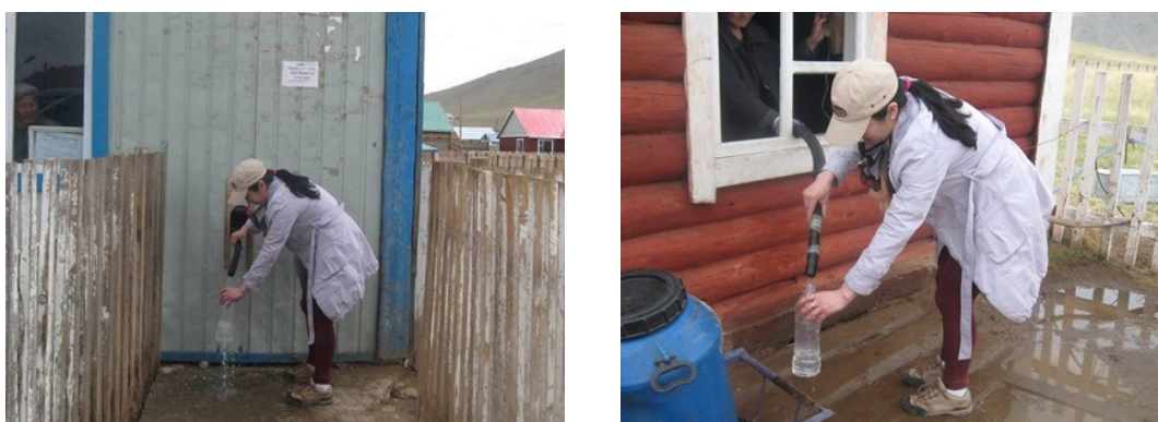
Figure 4. Groundwater sampling in school (right) and center of Jargalant soum (left)

place in valleys of large rivers where they impact on. Upstream of Ider River is characterized as hydrocarbonate type with total anions and cations of 173.1 mg/dm 3 , hardness of 1.7 mg-