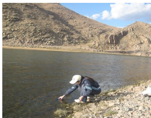
Figure 3. Upstream (right) and downstream (left) of Ider River. 09.20.2013