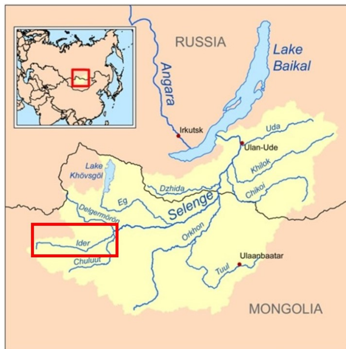
Figure 1. Geographical location of Ider River.

In 1950-1960s, hydrologist Kuznetsov conducted hydrological survey in Mongolia including morphometry and water regime of